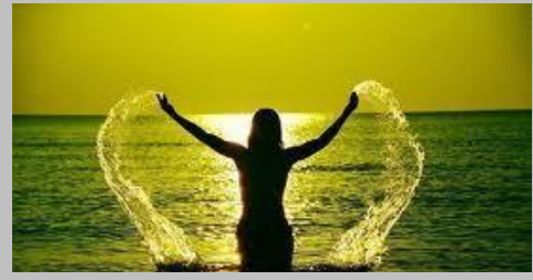
God Has A Plan To Set You Free

Be baptized, worship, fellowship, and serve with other Christians in a church where Christ is preached and the Bible is the final authority.